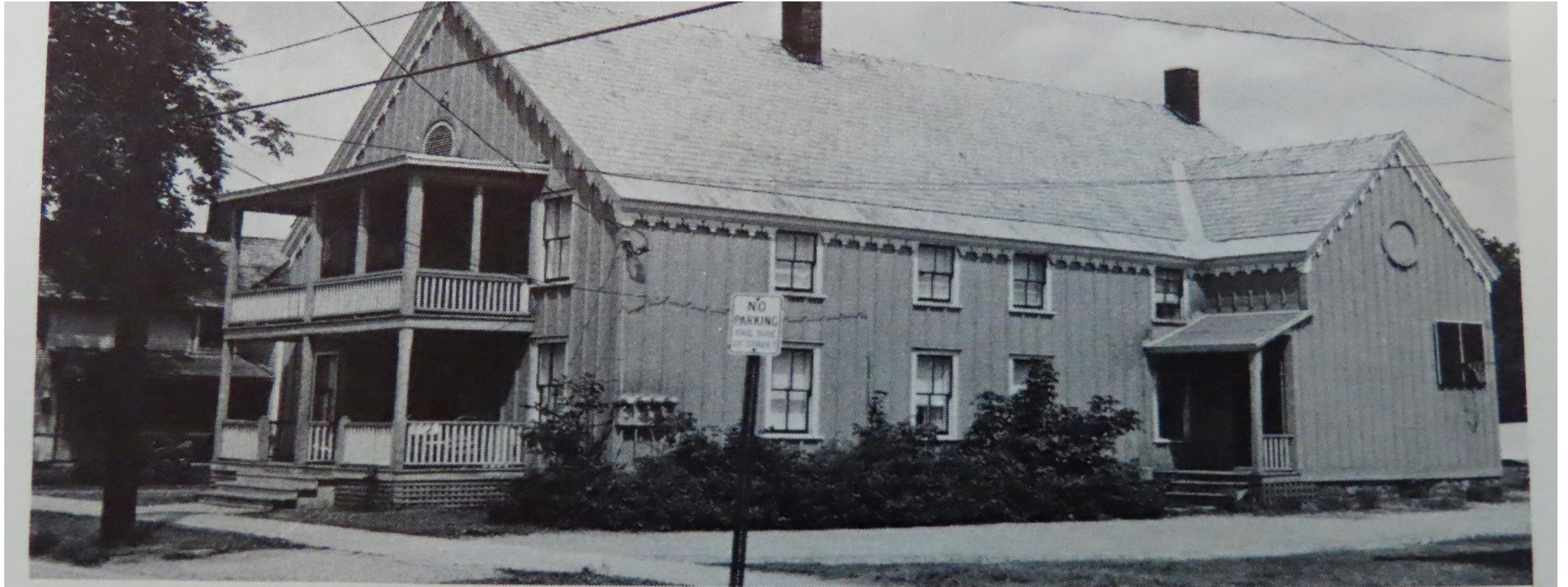
FRENCH BAPTIST CHAPEL (now an apartment house)