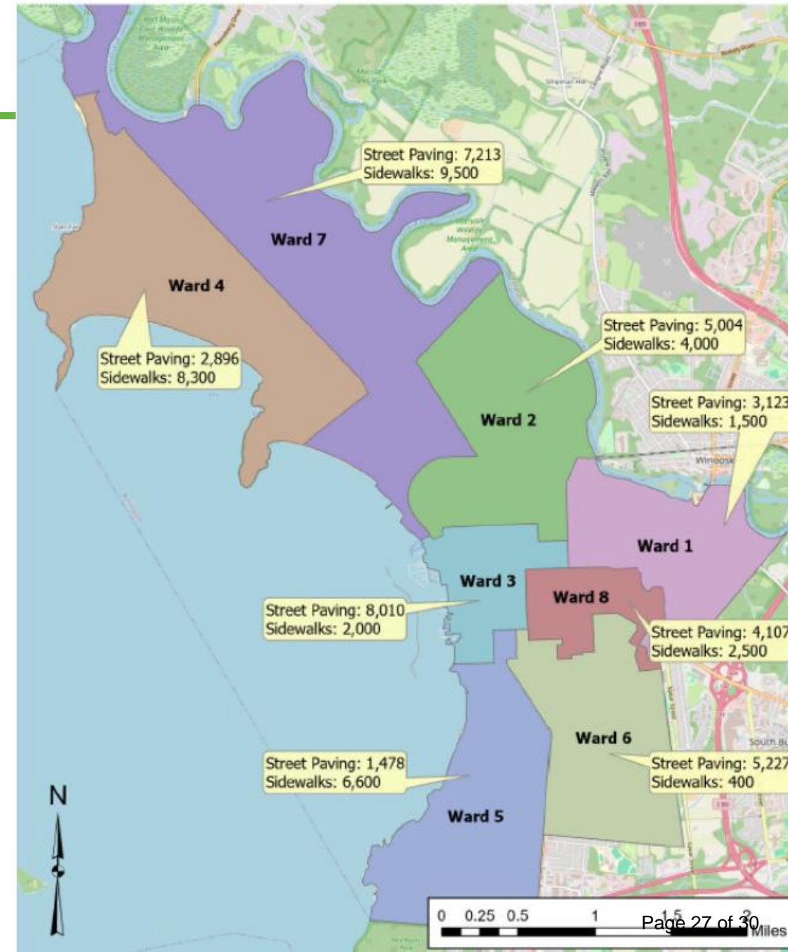
Proposed Sidewalks (CY 26-30) and Street Paving (CY 26-28) Linear Foot Paving/Replacement per Ward

Examples: project provides annual energy cost savings and is part of the City's NetZero plan for Facilities; project reduces stormwater flow into Lake Champlain