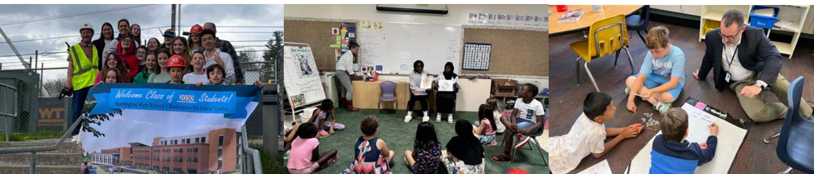
Development of BSD's budget is informed by the District's Strategic Plan and our North Star: every learner is challenged, empowered, and engaged. Turn this document over to learn more about the budget.